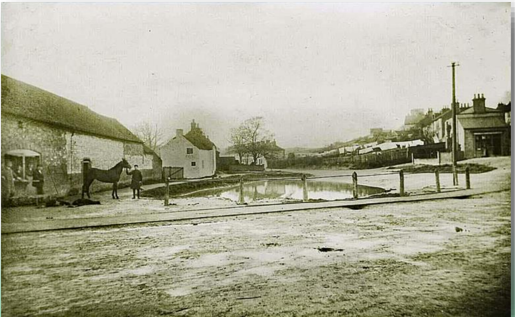
The Pond - Langtoft

Local News and 'What's On' guide serving and delivered to: Butterwick, Foxholes, Langtoft, Octon, Swaythorpe, Thwing & Wold Newton Also available as a download in neighbouring villages: Kilham, Burton Fleming & Rudston